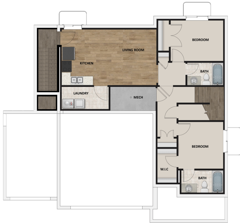
Finished Basement Floor