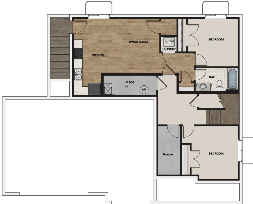
Finished Basement Floor