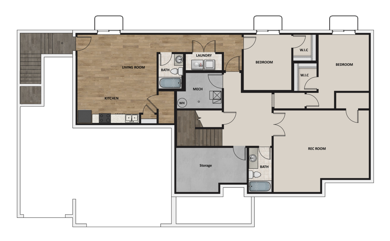
Finished Basement Floor