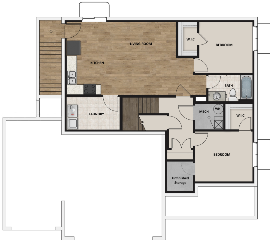
Finished Basement Floor